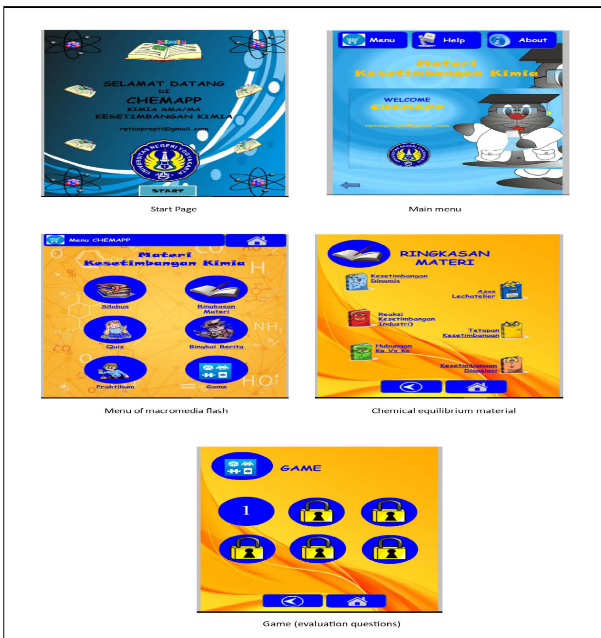
Figure 1: The display macromedia flash